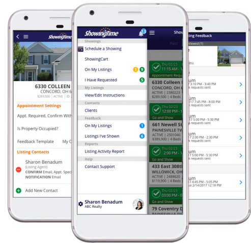
Available as a free download on iOS and Android